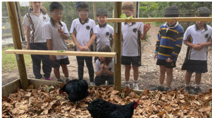
▲ Our Junior School students enjoying their new orchard and chicken coop, funded in part by the Old Carey Grammarians Association last year.