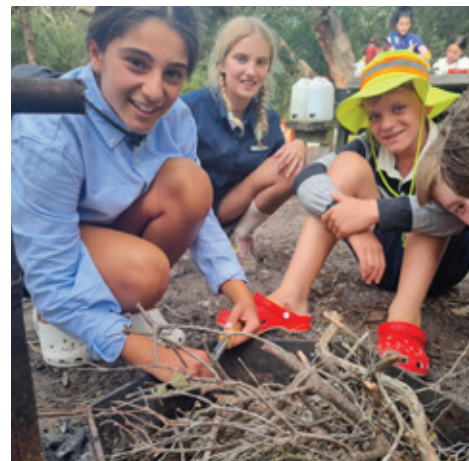
▲ Camp Toonallook team building.