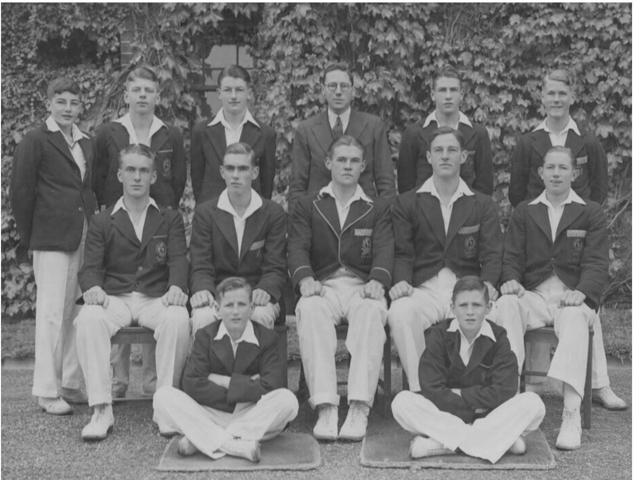
Carey Cricket team 1940