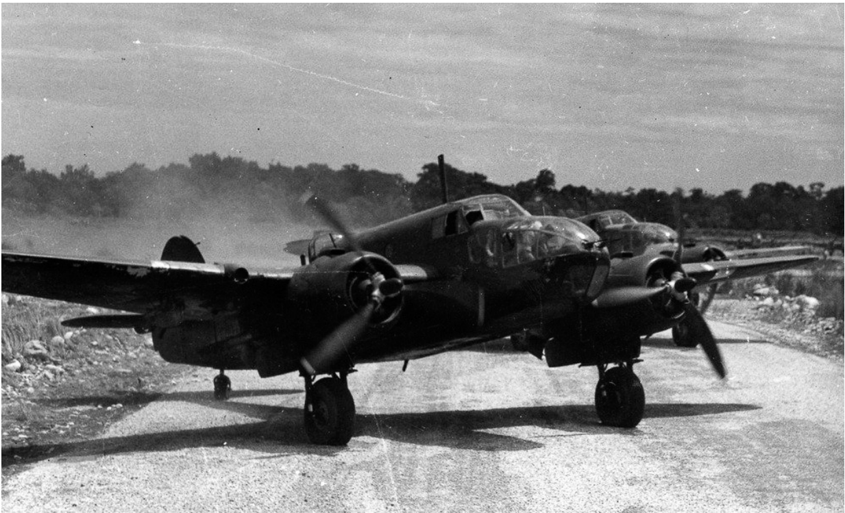
No. 6 Squadron Beauforts on Vivigani Airstrip on Goodenough Island