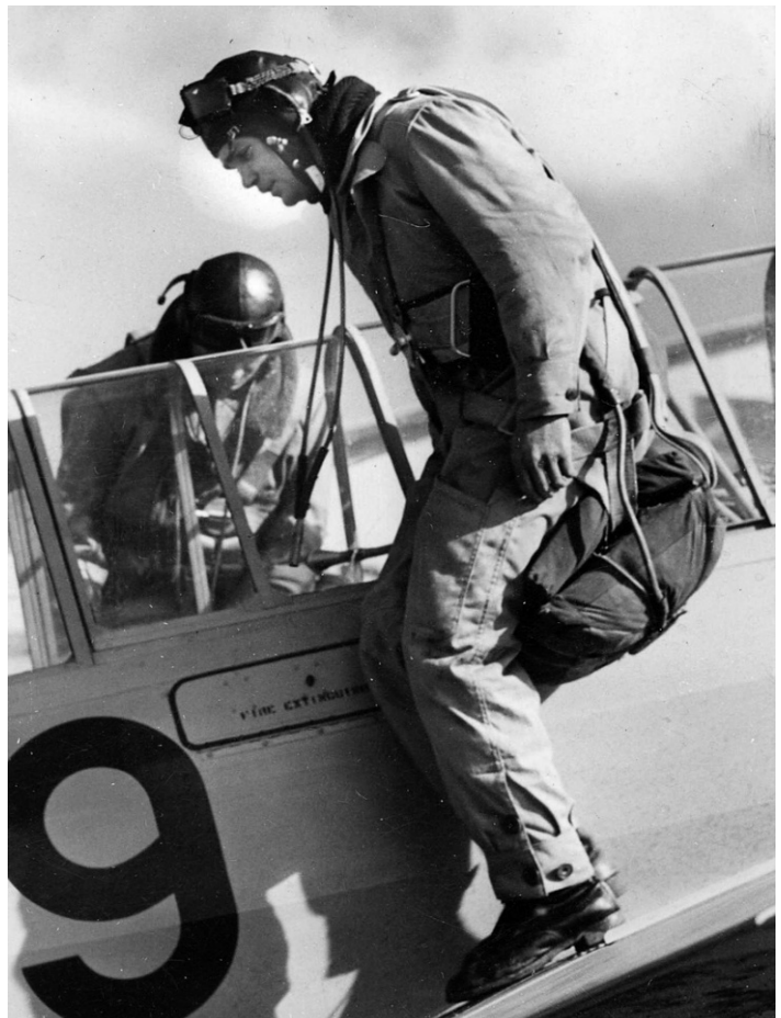
After ground school wireless students at Ballarat gained experience in the air in Australian designed and built Wackett Trainers

Gordon's first flight in a Beaufort was on 2 February 1944 in aircraft A9-98, performing masthead and bombing practice during a one-hour flight an early and formative experience in turret handling.