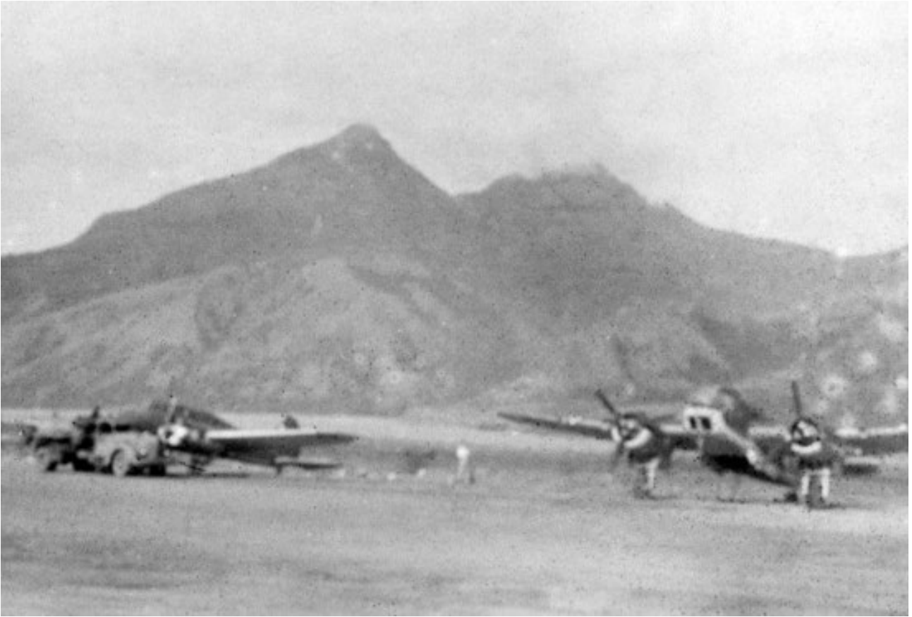
An Avro Anson of the Rescue and Communication Squadron, and a Beaufort (produced at Fishermen's Bend by the Department of Aircraft Production) of No. 100 Squadron, at Vivigani airfield on Goodenough Island, 21 July 1943