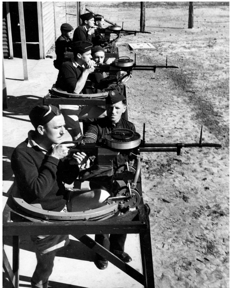
Gunnery School, West Sale

A Beaufort crew typically consisted of a pilot, a navigator/bomb aimer, and two wireless air gunners. The crewmen would often alternate duties during an operational sortie or op, one operating the turret on the outbound leg, then switching to wireless operator on the return.