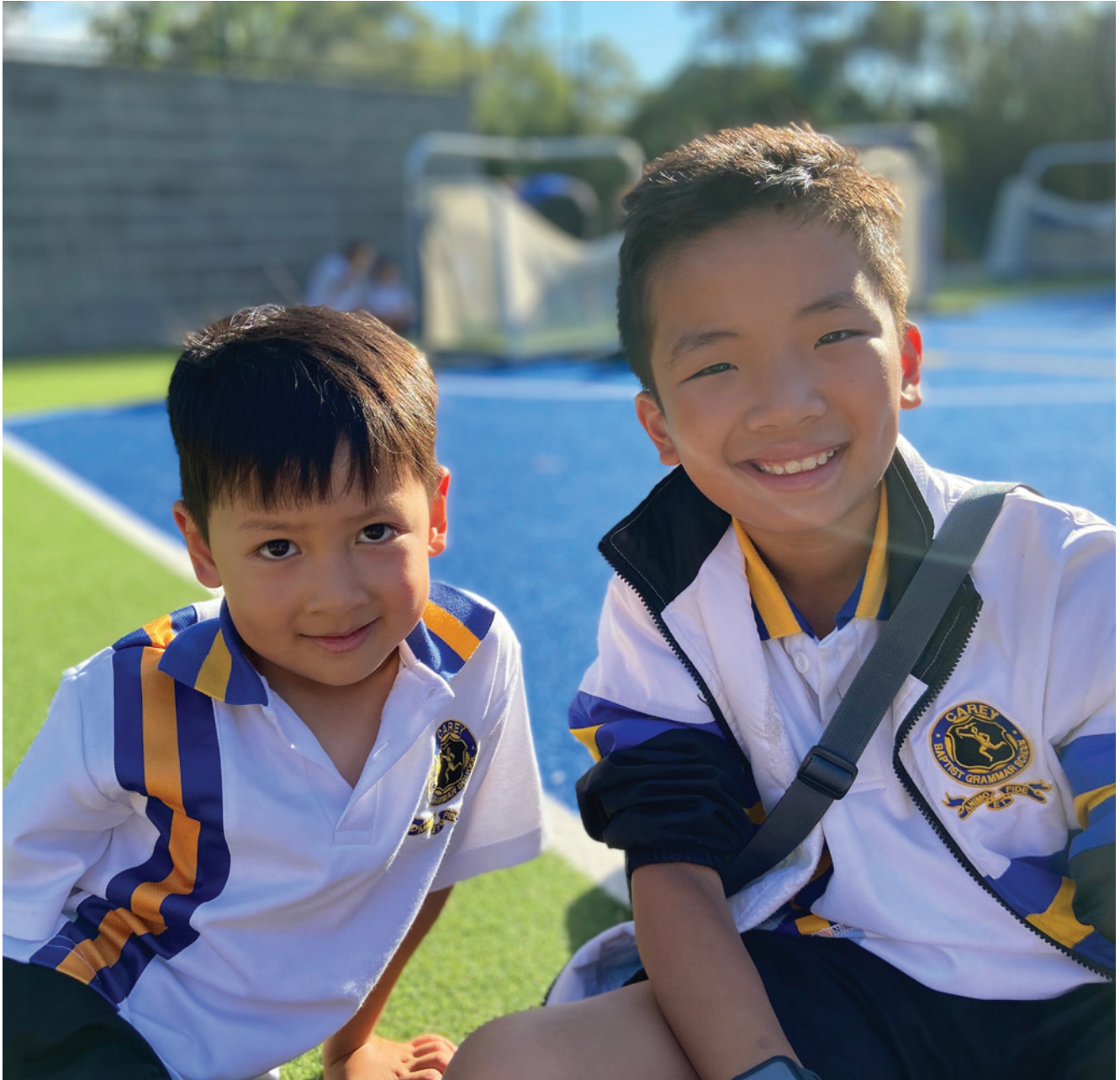
▲ Year 6 Buddy Program at Junior School Donvale