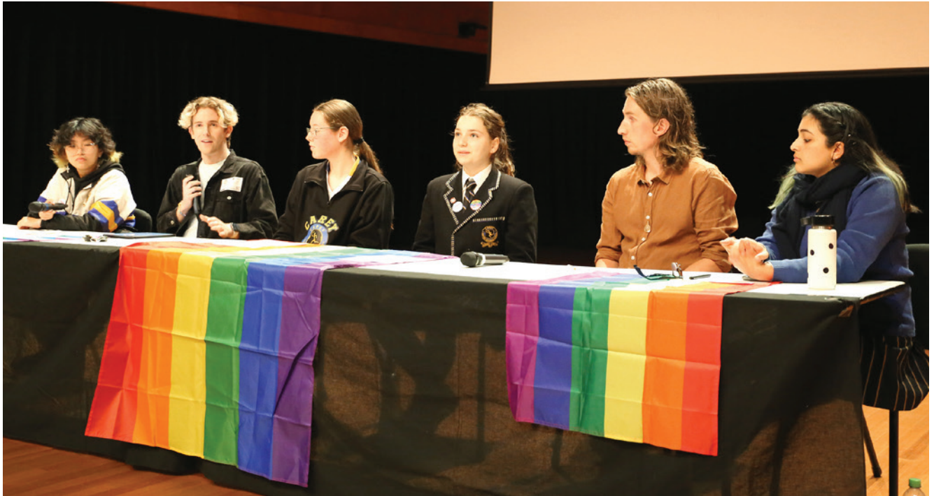
▲ Carey's 2022 Pride Week Panel spoke openly about their own experiences of being part of the LGBTIQ+ community.